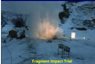
Fragment Impact Test

SAS has a tool in help file which covers all the main user requirements.