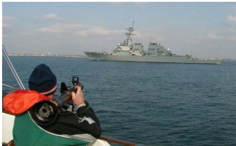
Figure 3. Shaped Charge Jets are the most challenging IM threats

The original IM hazards (circa 1980) were simply defined as heat (fire), shock (blast overpressure) and impact (bullets and fragments). In the past, very little attention has been paid to the very difficult threats like shaped charge jets. This is a very real threat, especially in the global war on terror now (see Figure 3), one that's an emerging IM challenge for the vast majority of our weapons. Will there be other threats in the future — unplanned stimuli such as electromagnetic pulses, chemical contamination, and radiation among others — that the next generation will encounter? The entire IM process must continue to evolve to meet these future demands.