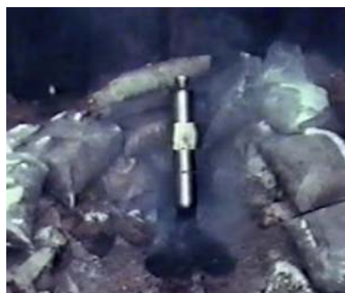
Figure 4: Response to bullet attack - puddle of propellant (liquid)

Control: Normal fire extinguishing techniques, although vented oxidiser may cause some complication. Treatment as above.