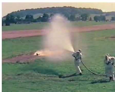
Figure 2: Control of a simulated motor accident