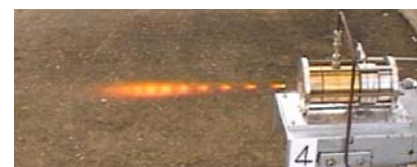
Figure 5: Typical firing of the test motor

The control of the motor was automated via a computer system so that thrust requirements representative of operational usage could be tested. These basically consisted of two variants; the first being a pre-programmed thrust profile stored as a data file on the computer. This allowed reproducible tests, for example establishing the maximum duration of thrusting that could be used for range extension. The second mode of operation made use of the computer to control the initial burn period and ensure safe operation, but after a preset thrust time it passed control over to the operator. The thrust could then be controlled via a push button to give a real time response. Although this admirably demonstrated how a missile could respond to operational requirements during flight, it also provided a range of random thrust profiles that fully tested the motors response. A total of 32 bi-propellant and 2 monopropellant firings were performed.