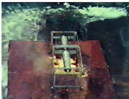
Figure 3: Tests show the spillage of a hypergolic fuel and oxidiser.