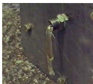
Figure 1: Gelling effectively controls propellant spills.

The balance between the advantages and disadvantages of bi-propellants and solid motors now needs re-examining. This poster aims to provide an overview of the relevant issues and a brief outline of some recent QinetiQ research in this area.